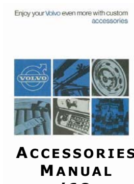
ACCESSORIES MANUAL '68