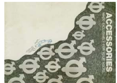
ACCESSORIES MANUAL '70