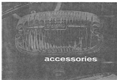
ACCESSORIES MANUAL '63