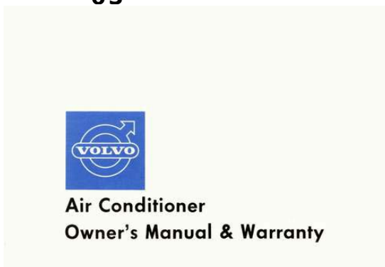
AC OWNER'S MANUAL